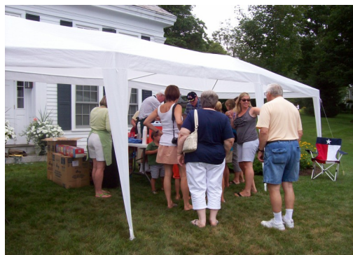
On a hot afternoon visitors line up for free ice cream at the Annual Ice Cream Social