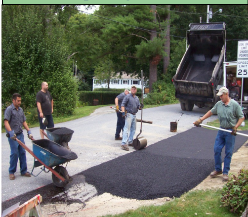
Lionel Beaudoin and crew paving the swales and regrading and compacting the driveway