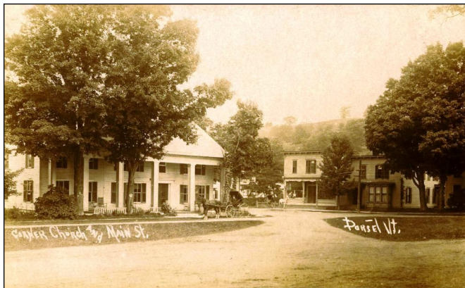
The Dorset Inn – circa 1900

Volunteers have continued to make remarkable progress on the collection-wide inventory we have been working on since the beginning of 2009. The process will be completed by the end of this year. Many items have been re-housed in archival boxes, which have been placed on new shelving with new labels. We are learning many things about the collection through this process, and an overview of inventory results will be created during the winter with new projects described for the future.