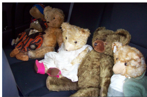
Teddy Bears on their way to the Historical Society