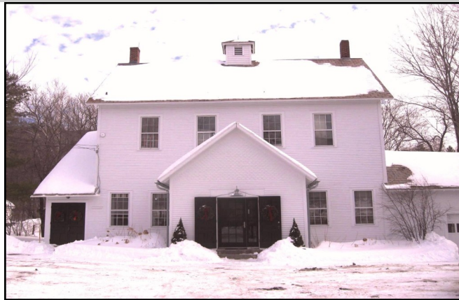
South Dorset School on Route 30, now home of Romano Publishing

A DHS program, "Dorset's Schools: 1785 to the Present," will be presented on Sunday, March 6, at 3 p.m., at the Dorset Church. Come, learn about these schoolhouses and education in Dorset. Bring your curiosity, or -if you have them, -your photos and memories of attending one of Dorset's early schools.