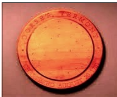
Wood Serving Board designed by J.K. Adams Co. $35

Bley House Museum lawn. Tickets on sale at the DHS gift shop, Dorset Town Meeting, Farmers' Market and other locations as weather permits.