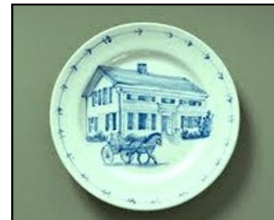
Ceramic Plate by Janno Gay picturing Bley House, to be raffled August 20

Raffle Ticket Sales Are Underway: Buy a chance to win a one-of-a-kind 16-in. X 6-in. blue and white ceramic bowl with scenes of Dorset or a 10-in. ceramic blue and white ceramic plate with a picture of the Bley House, designed exclusively for the 250 th Anniversary celebration by Janno Gay of Flower Brook Pottery. Chances are $1 each or 6 for $5. Drawing will be August 20 at the annual Ice Cream Social on the