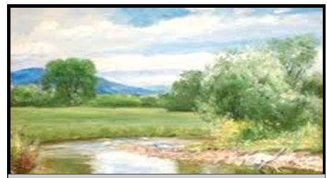
Mettowee Valley — Oil on canvas Ca. 1925

As always, please feel free to visit the museum at any time during these quieter winter and early spring months when many spaces in the museum are in transition. A winter project to re-design the Reception Area to better accommodate the new computer system and improve the office space and gift shop is already partially completed. There is always time for visitors.