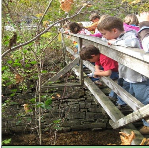
Third graders looking at marble wall made to direct water toward the marble mills in EastDorset

Please come into the museum and enjoy the New Exhibitions for 2011 – Opening Reception is Friday, June 17<sup>th</sup> from 5:00 to 7:00 P.M.