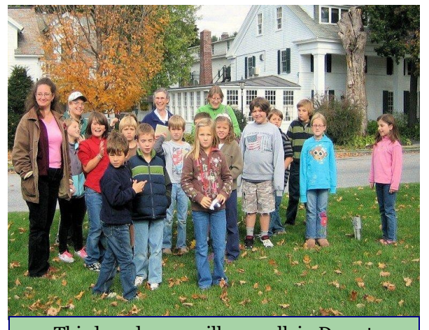
Third graders on village walk in Dorset