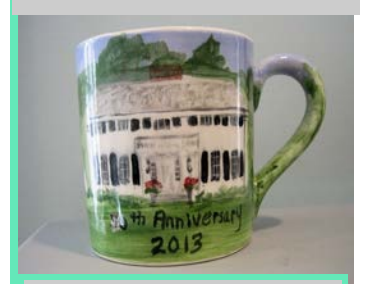
Our 50th Anniversary handpainted mug for your coffee - only $20