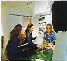
Left: Dorset middle school students study Dorset's marble industry in the museum's marble gallery.