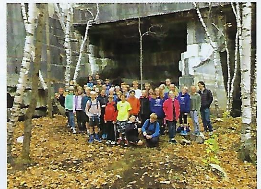
Right and below right: Dorset School students hike to the Gettysburg Quarry.