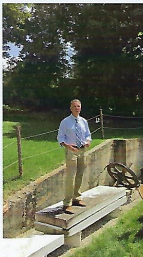
Left: Vermont Governor Phil Scott speaks at the Dorset Historical Society