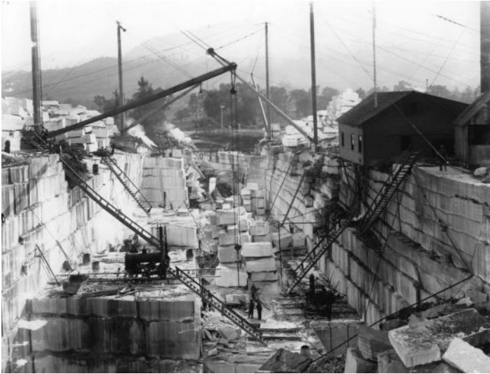
Then Norcross-West Quarry, 1910