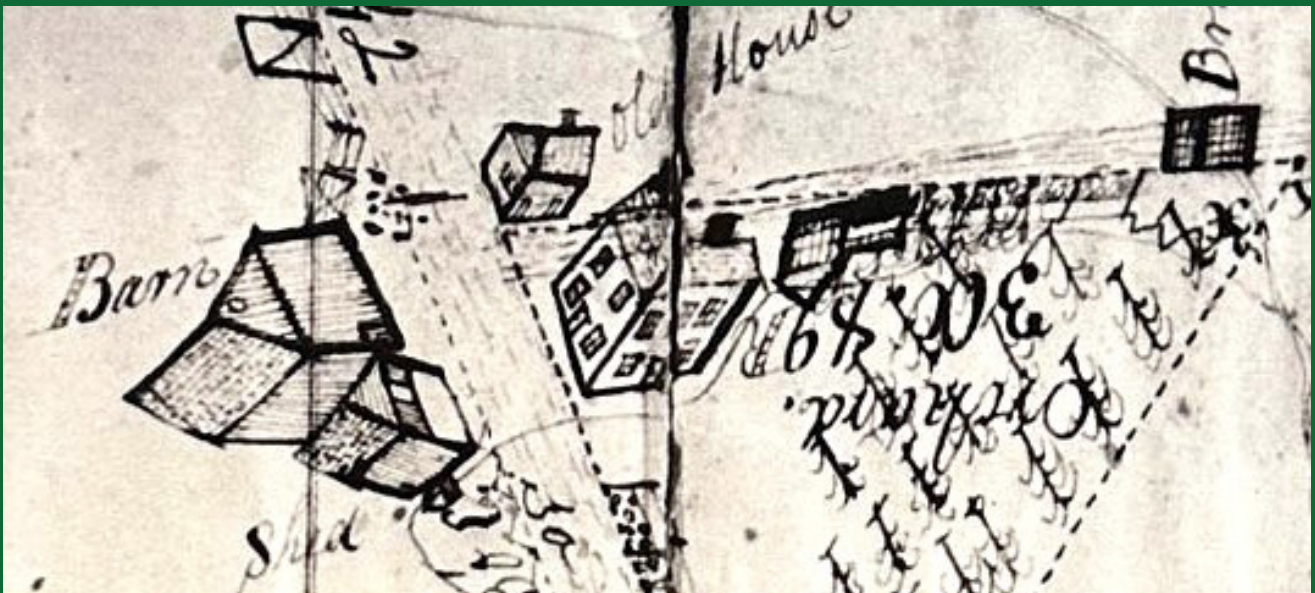
Cephas Kent's Tavern labeled here as "Old House"