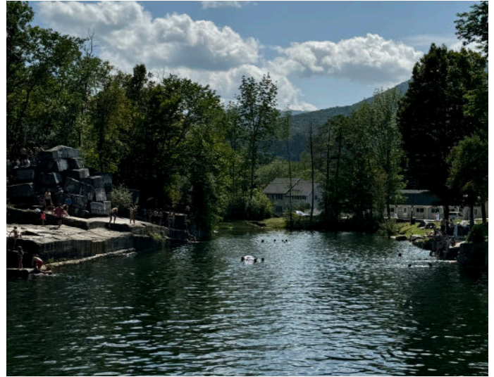
Now Swimming Hole Quarry, 2024