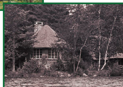
Octagon House North Dorset Exhibit