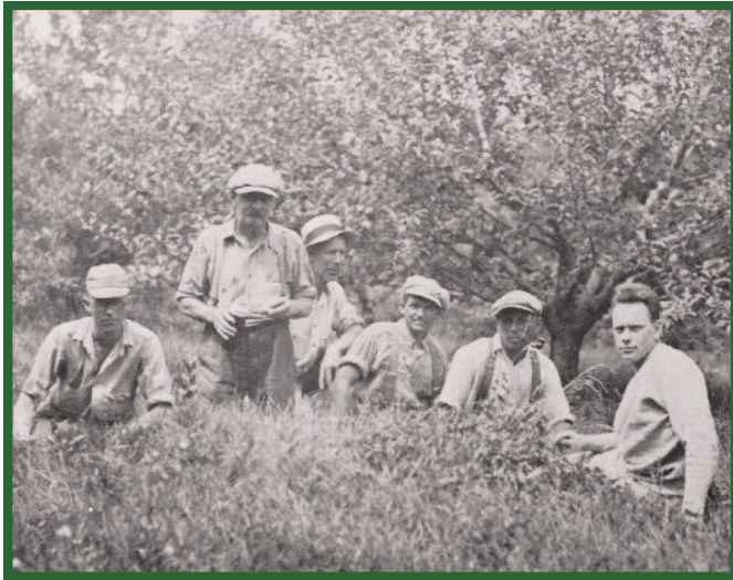
Then Workers at West Orchard, c. 1910