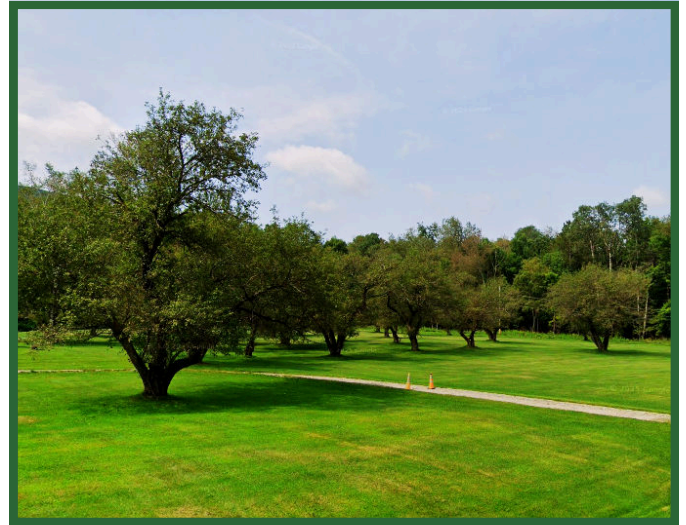
Now Apple Trees near West Orchard, 2025